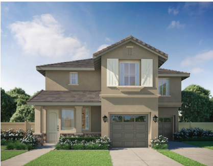
ELEVATION C - FRENCH COUNTRY