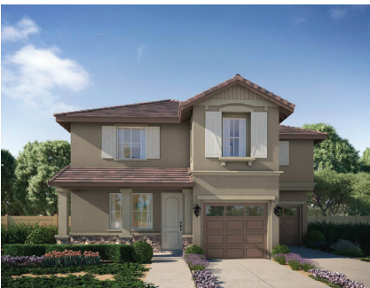
ELEVATION C - FRENCH COUNTRY