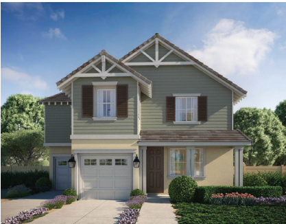
ELEVATION B - FARMHOUSE