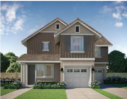
ELEVATION B - FARMHOUSE