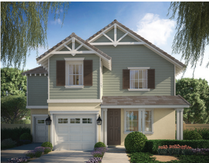
ELEVATION B - FARMHOUSE