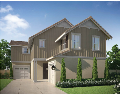
ELEVATION B - FARMHOUSE