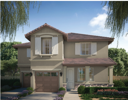
ELEVATION CR - FRENCH COUNTRY