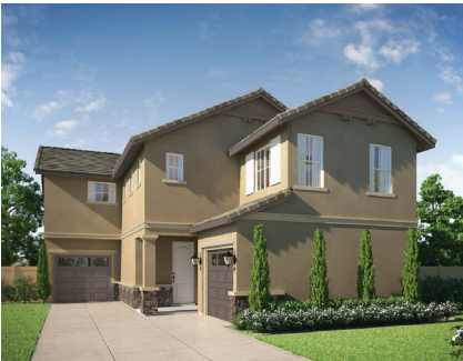
ELEVATION CR - FRENCH COUNTRY